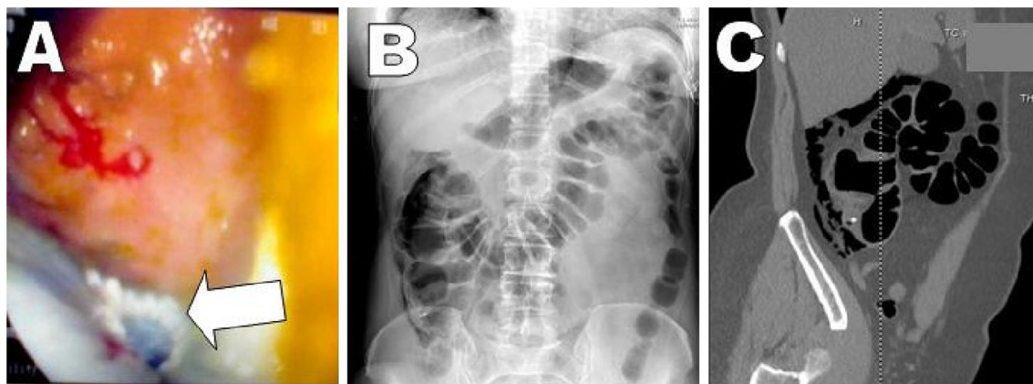
Fig. 2 Postendoscopic mucosal resection (EMR) perforation ( white arrow ) (a) with free air in the abdomen on X-ray (b) and computed tomography scan (c)

to be a cost-effective strategy only for those patients receiving antiplatelet or anticoagulation therapy [86]. However, if the polyp is very large (>2 cm) and positioned proximal to the splenic flexure, application of clips to prevent delayed bleeding could be a prudent approach. For small polyp resection, the use of a mini-snare without electrocautery instead of hot biopsy forceps is recommended [33]. Indeed, polypectomy with hot biopsy causes more submucosal damage, and it is associated with an increased risk of bleeding, especially when used in the right colon [32, 87].