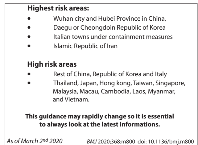
Figure 1. Risk assessment by country.

A tricky issue in this epidemic context is patient risk stratification and definition of subgroups of patients. We believe it is important to adopt a common definition of potential COVID-19 patients. According to several recently issued guidance, COVID-19 should be considered in anybody who has been in contact with confirmed SARS-CoV-2 infection or has returned from a high-risk country in the 14 days before the onset of following symptoms: fever (even without respiratory symptoms), cough, acute respiratory infection of any degree and severity (with or without fever), severe acute respiratory infection requiring hospital admission, and clinical/radiologic evidence of pneumonia. Contacts are defined as those living in the same household as a patient with a confirmed infection, those with direct or face-to-face contact (for any length of time) with an infected person or with his or her biologic